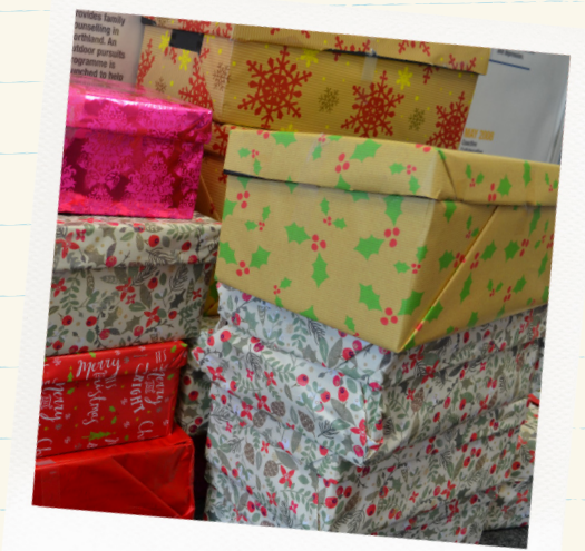
Christmas food boxes