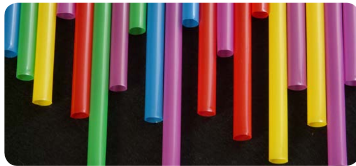
(Thanks Auckland E-News for the graphic)

Imagine what churches could do with this challenge!